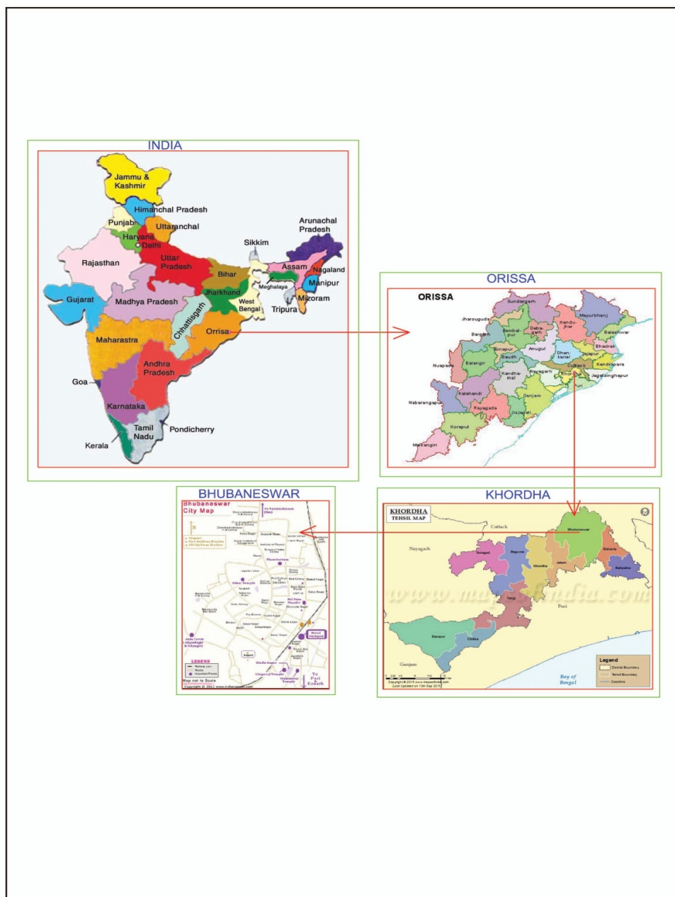
Fig. 1 Location of Bhubaneswar City

Bhubaneswar is located in the Khurda district of Odisha , India between 20^{\circ} 12' N to 20^{\circ} 25' N latitude and 85^{\circ} 44' E to 85^{\circ} 55' E longitude on the Western fringe of the coastal plain across the main axis of the Eastern Ghats. The present study is confined to the Bhubaneswar city coming under Bhubaneswar Municipality Corporation (BMC) having an area of 146 Sq.km. with 67 wards. (Fig.1)